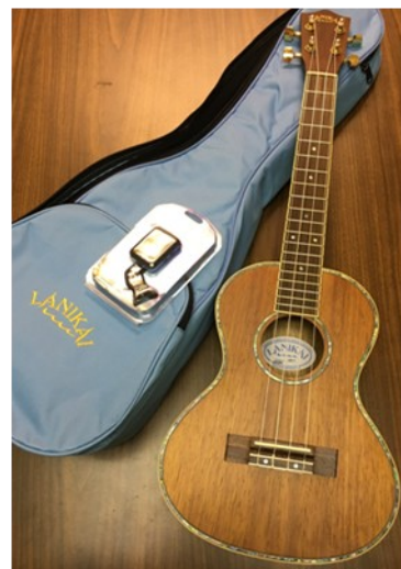
Donated by Rieman Music