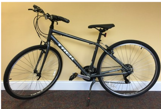
Donated by Connecticut Yankee Pedaller