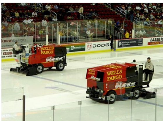
And who can resist bidding on a zambone ride donated by the Iowa Wild!?!

This year's silent auction has many NEW items and many old favorites! Much time has been spent on contacting businesses to make this year's auction a success! More details will be given in next week's newsletter. The final item list will be posted in our August 1 newsletter.